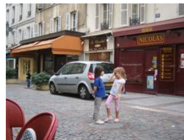
The block - street and building

This deals with acute concerns of human settlement and urban development. It creates a specialized field of growing complexity, retorting to the urban complexities. It relates to the social, behavioral, and cultural relationships between people and the form and quality of their built and natural environment; the financial, managerial, political, and participatory scopes of planning, design, and development leading to the modeling of urban areas and regions.