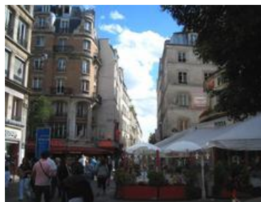
The neighborhood -district and corridor