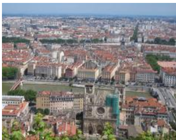
The region - city and town