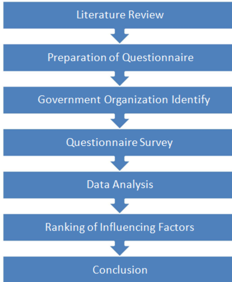
Figure:1 Adopted Methodology

The survey was conducted at various sites so as to collect data required for assessment of factors affecting the selection of contractor. The population for the study comprises of representatives of government organization who have been involved in the management and execution of public projects where selection assurance practices are of paramount effect within the study area. The population was determined by selecting respondents at random. Further the collected data was analyzed so as to rank those factors as per their degree of importance. Figure 1 presents the methodology adopted for dissertation study.